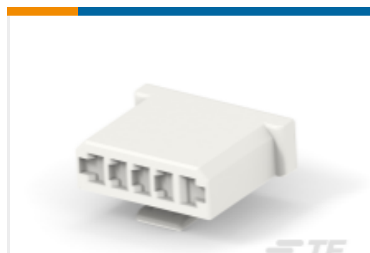
TE Part # 880192-1 5W FASTIN-ON REC. H