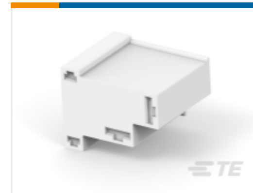
TE Part # 880103-1 5 WAY FASTIN ON HSG